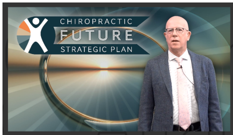
Government Affairs Update