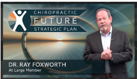
Strategic Plan History