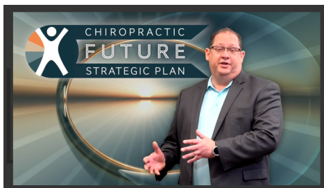
Leadership Team Update

https://www.chiropracticfuture.com/media