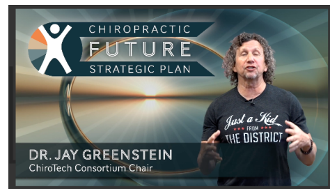
ChiroTech Consortium Update